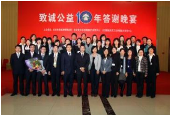
Annual Appreciation Dinner of Zhicheng

Zhicheng Public Interest Law (ZPIL) is the largest public interest legal service organization in China and is an umbrella group that encompasses several subsidiary organizations. In 1999, ZPIL established the Beijing Children's Legal Aid and Research Center (BCLARC), China's first NGO to specialize in children's rights. In nearly twenty years of development, it has expanded its services into migrant workers' rights protection, criminal legal aid, child care foundation and nonprofit organizations' legal services.