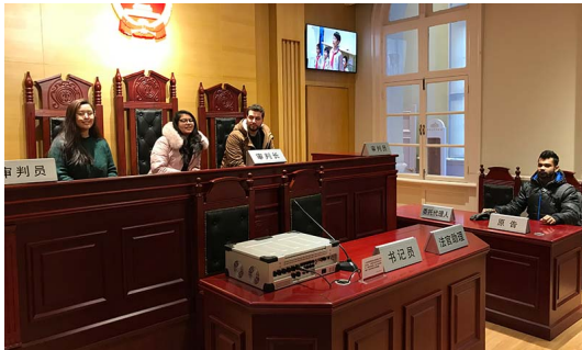
Interns visit the China Court Museum

Interns conduct research in their area of interest and publish reports used by our top attorneys. While internships are unpaid, the experience gained working with one of the top legal NGOs in China creates a foundational understanding of international law unparalleled by any other opportunity.