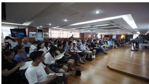
Beijing Zhicheng Social Organization held the "China Foundation Legal Risk Report" conference on August 7, 2018

Since its establishment, the center has provided more than 1,000 instances of legal services for Chinese social organizations. It has been invited by the ministry of civil affairs to provide legal capacity building training to more than 2,000 foundations and social organizations.