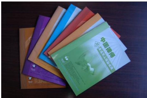
A series of ZPIL research publications

protection, migrant worker workplace injury and migrant worker wages has impacted popular legislation in China. In 2012 the Criminal Legal Aid Research Center published an evidence-based report on the criminal justice system in China that analyzed nearly 200 hundred cases and their outcomes, and provided recommendations for future reforms to the criminal justice system in China.