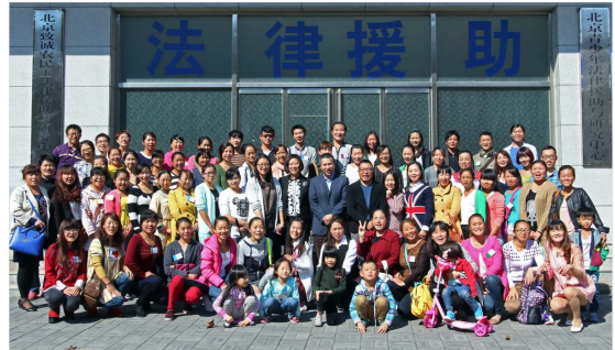
Beijing Zhongzhi Child Care Foundation provides training for rural kindergarten teachers

education training for preschool teachers in remote villages and promote the development of education career of rural children. CKDP relies on rural kindergartens to establish "left-behind children love home" to care for left-behind children in rural areas. CKDP has been implemented since 2014 and has supported 392 rural kindergartens.