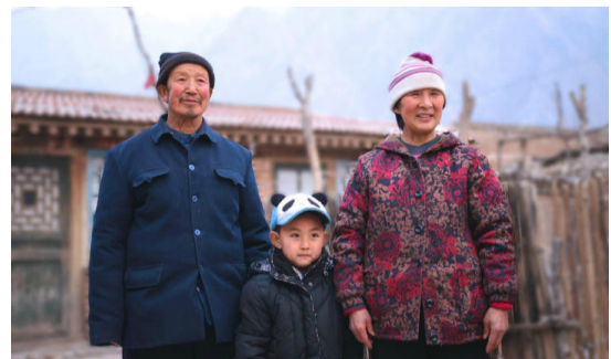
Beijing Zhongzhi Children' Care Foundation's small amount of love funding aid recipients

Due to the underdevelopment of social assistance system, when underprivileged kids whose rights are infringed and the law is not powerful enough to protect them, these kids should receive more support from the society. “A New Start – Small-amount Aid” Program is designed to help these children go through a tough time and to build their confidence on life. We hope the Program to be a new start in their life. Since the establishment of the Fund, we have provided financial support to nearly 1120 minor victims, including victims of sexual assault, child labor, work-related injuries, traffic accidents and other major personal injury accidents. The Fund supports the expenses related to education, vocational skills training, medical assistance, psychological rehabilitation, etc.