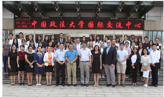
International interns participate in the College Student Forum held at the University of Political Science and Law