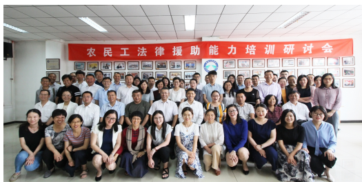
Beijing Zhicheng Migrant Workers Legal Aid and Research Center provides training for legal aid lawyers

Beijing Zhicheng Migrant Workers Legal Aid and Research Center (BZMW) was established in 2005. It is the first non-profit organization to specialize in legal aid for migrant workers in China. By the end of 2016, the center received nearly 80,000 legal consultations, involving more than 200,000 migrant workers, and recovered more than 160 million yuan in compensation for migrant workers.