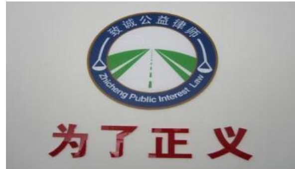
The logo of Zhicheng Public Interest Law and its Chinese motto, in red, which translates: "For Justice"

Model 4: Internationalization Model – stresses gradually strengthening the international dimension of our work and network. As economic and social conditions develop domestically, China will have more means to integrate into the world civil society. Chinese organizations like Zhicheng will have more influence if they build international connections along the way.