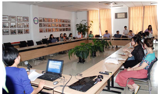
Interns discuss cases of migrant workers' crimes with lawyers