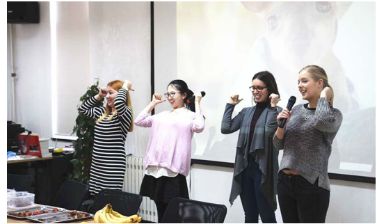
Interns from Australia sharing their local culture