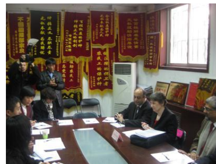
ZPIL hosting UNDP Administrator Helen Clark (middle-right)

renowned individuals and delegations. Some examples of previous visitors include Yoo Soon-taek, wife of United Nations Secretary General Ban Ki-Moon, the German Human Rights delegation, the European Human Rights delegation, the National Committee on United States-China Relations, and the Vietnam Public Interest Lawyers Delegation among many others. We also promote international exchange through partnerships with top U.S. law schools and through accepting international interns. We have thus far hosted 35 foreign interns and received several delegations from institutions such as New York Law School and Whittier Law School.