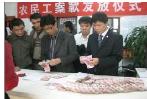
Lawyers distributing case compensation to their clients, migrant workers

ZPIL organizations operate in five specific areas. The first is providing direct legal services to our clients. As of June 2012 there have been over 145,000 total direct beneficiaries of the BCLARC and the BZMW in Beijing. In conjunction with our affiliated offices, we have been able to reach 345,000 direct beneficiaries in terms of help and free legal consultations in 122,885 cases with children and migrant workers. Through mediation, arbitration, and litigation, we have settled over 21,610 cases with a total of nearly 300 million RMB claimed as payment and compensation for our clients.