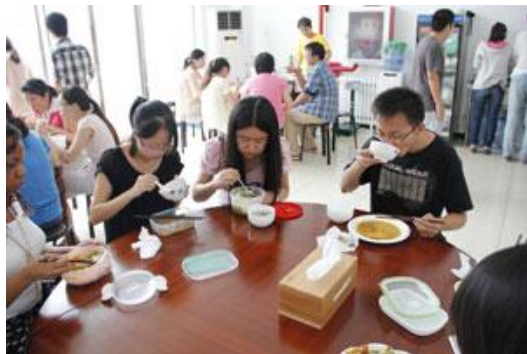
Lunch in Zhicheng's dining hall