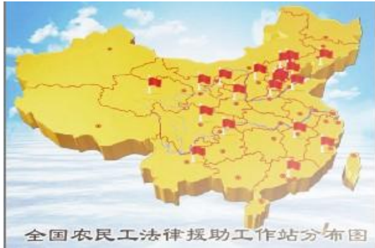
A map of China with locations of ZPIL affiliated offices marked with flags

Finally, we promote our work by building relations within the community. Part of ZPIL's mission includes educating members of the public on their rights as citizens and on the legal profession. We hold classes and workshops where we educate children and migrant workers on their specific rights. To date we have educated over 100,000 children and migrant workers. As described earlier, we work with the government to collaborate on programs, conferences, and legislation drafting. We also maintain our influence and spread knowledge of Zhicheng through our media relations and campaigns.