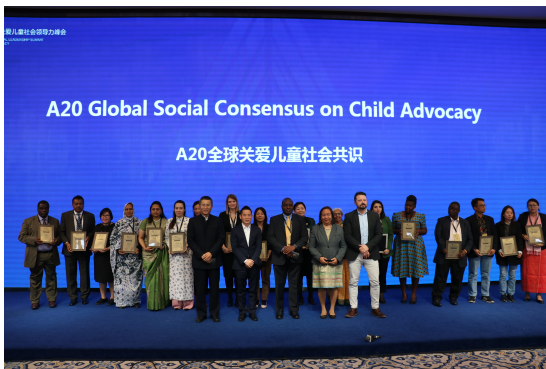
A20 Global Social Consensus on Child Advocacy Opening Ceremony

On March 2018, BLCARC and Alibaba Group co-hosted the A20 Global Social Leadership Summit on Child Advocacy in Beijing. Representatives of non-government organizations on child care and protection from 20 countries from Asia, Africa and Europe participated and shared their experiences and challenges, and came up with the A20 Global Social Consensus on Child Advocacy.